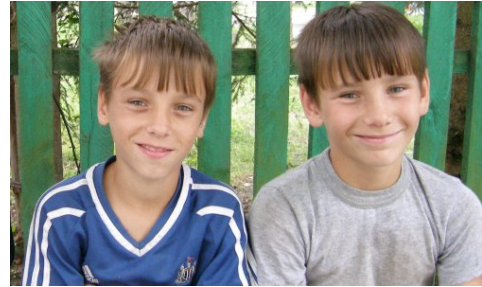
brothers or siblings